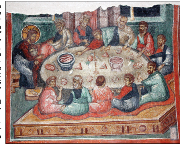
A Kremikovtsi Monastery fresco (15th century) depicting the Last Supper celebrated by Jesus and his disciples, Bulgaria, 16th century AD

This beautiful feast of the Body and Blood of Christ reminds us that we, who are sustained in our faith by the Risen and Glorified Lord, are in turn to become food for others on our common pilgrimage of faith.