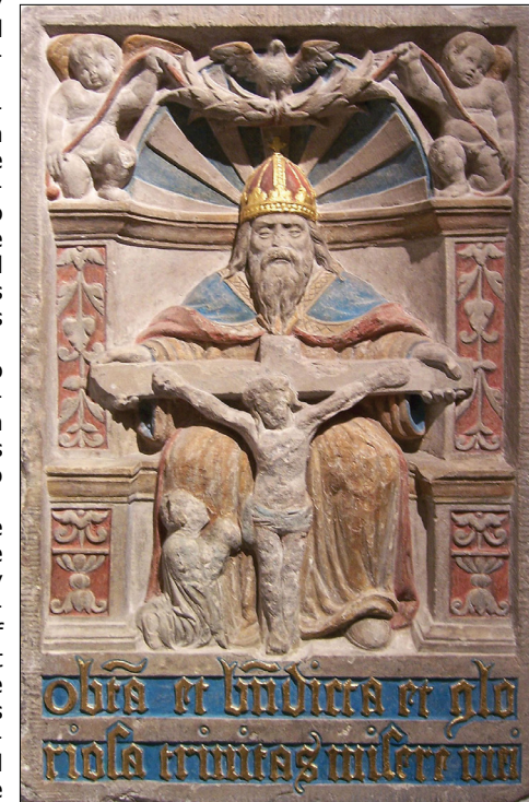
Representation of the Trinity in the form of the mercy seat (epitaph from 1549) at the Bremen Cathedral, Germany

These words capture the true purpose of pilgrimage. It is not a sightseeing tour, a stroll through a forest or the ascent of a mountain. On the contrary, it is a journey that takes us inward. The great Dominican mystic, Meister Eckhart, said that if the spiritual life is a journey, it is about one centimetre long but many kilometres deep. In that depth we discover the mysterious working of the Spirit, who groans within us, saying – and teaching us to say – "Abba!"